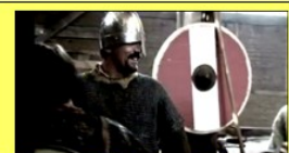
Beowulf & the Anglo-Saxons (Part 6)