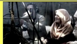
Beowulf & the Anglo-Saxons (Part 5)