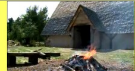
Beowulf & the Anglo-Saxons (Part 2)

Oft Scyld Scefing sceaþena þrēatum, monegum mægþum meodosetla oftēah, egsode eorlas, syððan ærest wearð fēasceaft funden;