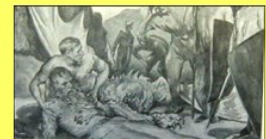
Beowulf & the Anglo-Saxons (Part 8)