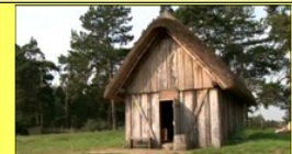
Beowulf & the Anglo-Saxons (Part 4)

hē þæs frōfre gebād, wēox under wolcnum weorðmyndum þah oð þæt him æghwylc þāra ymsittendra ofer hronrāde hýran scolde gomban gyldan. þæt wæs gōd cyning.