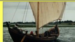
Beowulf & the Anglo-Saxons (Part 3)