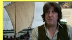
Beowulf & the Anglo-Saxons (Part 7)