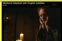
"Medieval Helpdesk" (A Little Helpful Humor)